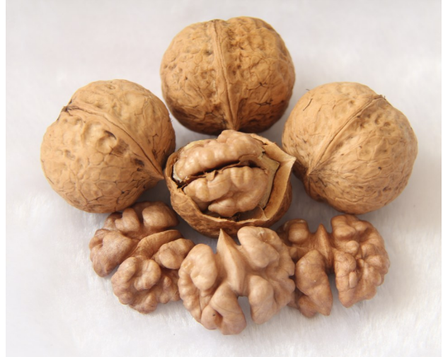
图 3 云香 1 号坚果品质特性

坚果圆球形, 三径均值 2.84 cm; 种壳刻纹大而浅, 厚度 0.87 mm; 单果质量 7.32 g, 仁质量 4.93 g, 种实饱满肥厚, 核仁浅紫色, 易取整仁, 出仁率 67.35% (图 3)。核仁含油率 65.1%, 蛋白质含量 18.5%, 食味香纯, 无涩味、口感细腻(表 2)。