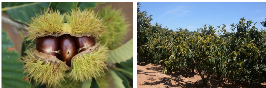
图 2 板栗新品种燕凤