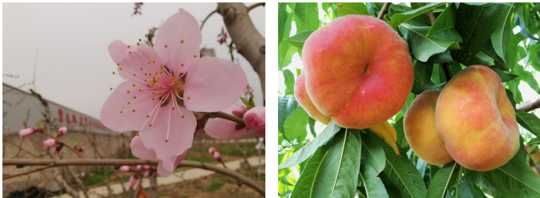
图 1 中蟠 102 花及结果状

中蟠 102 树体生长势较强，树姿半直立，萌发力强，成枝率中等。1 年生枝阳面红色，中果枝节间长度平均 2.36 cm。叶片长度中等，15.8 cm 左右，宽度略窄，约 3.8 cm，椭圆披针形，叶片横截面近水平，叶面呈绿色，叶背浅绿色，叶基锐尖，叶缘锯齿浅；叶柄长度中，叶柄蜜腺肾形，2~4 个。花枝粗度中等，花芽着生密，多复花芽。花蔷薇型，花瓣 5 枚，粉红色，萼筒内壁橙黄色，花粉多。