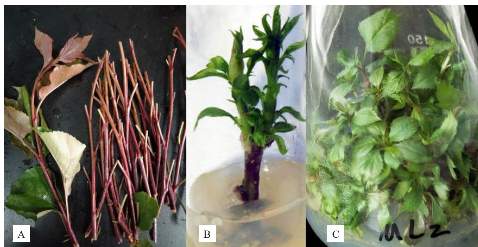
A. 剪取的半木质化枝条;B. 腋芽萌发;C. 无菌苗增殖。

将半木质化新梢芽段在腋芽启动培养基上培养3周,腋芽萌发并伸长生长形成无菌绿苗(图1-B)。无菌绿苗在继代增殖培养基上生长良好,既表现出良好的增殖生长,又有良好的伸长生长,月增殖倍数超过5.0(图1-C),表明鲁砧1号容易增殖扩繁。