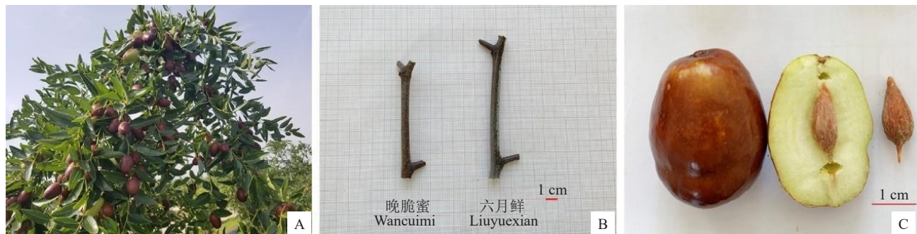
A. 丰产状;B. 节间对比;C. 晚脆蜜果实。

种六月鲜比较,表现果实成熟期晚、果肉质致密及枝条节间短等特异性,经SSR分子检测,DNA多态性高度相似,将其定名为晚脆蜜(图1,图2)。于